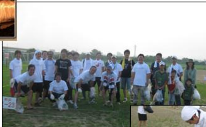
3 rd August 6am to 7:30am Cleaned up the area after the fireworks