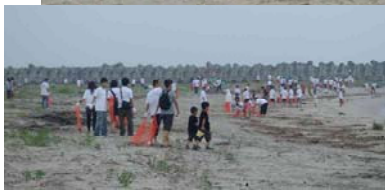
4 th July, 8am Cleaned up the Takahagi Coast