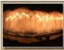
Fireworks in Nagaoka-shi 2 nd August