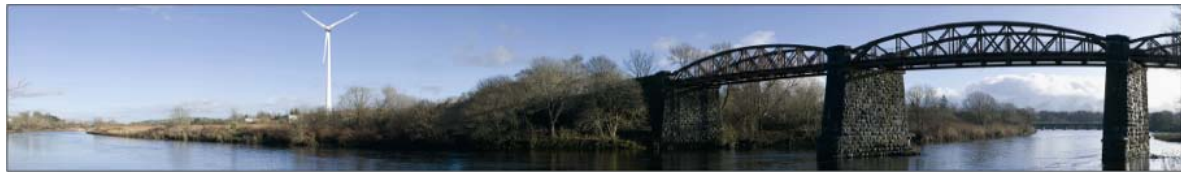
Image picture of the planned wind power generation facility at the Kerry Plant

This press release is part of Astellas' ongoing efforts to keep the public informed of the Company's efforts to reduce greenhouse gasses emissions and protect the global environment.